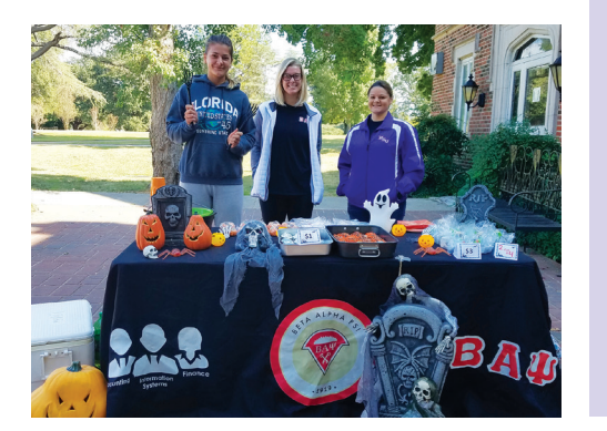
of professional, social and service activities, including the opportunity to meet business professionals and prospective employers in the surrounding communities, travel to regional and national meetings to network with other university students and our professional partners, and provide service to our campus and community.